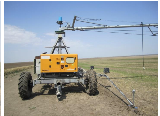
Linear – pivot

The length of the machines could be from 48 m to 1003 m. It is chosen for each customer on the individual basis