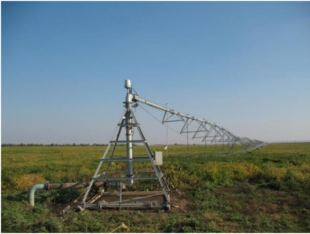
Center - Pivot

Irrigation machines DMF "Fregat" is the modern and efficient tool for field irrigation. Fregat Company produces all types of modern wide-level irrigation machines.