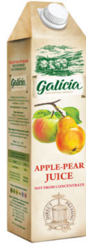
Apple-pear juice 1L