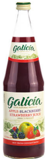
Apple-blackberry-strawberry juice 1L