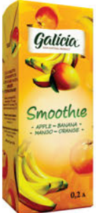
Apple-Banana-Mango-Orange Smoothie 0,2 L