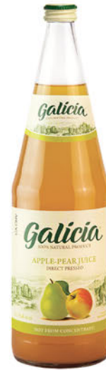
Apple-pear juice 1L