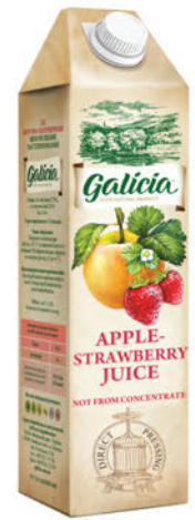
Apple-strawberry juice 1L