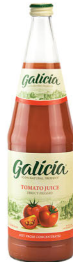
Tomato juice 1L