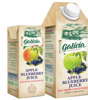
Apple-blueberry juice 0,2L, 0,5L