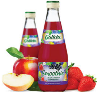
Apple-Pear-Black currant-Strawberry Smoothie, 0,3 L