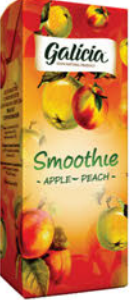
Apple-Peach Smoothie 0,2 L