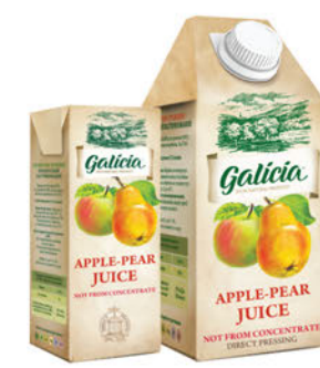
Apple-pear juice 0,2L, 0,5L