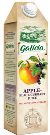
Apple-black currant juice 1L