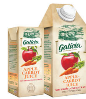
Apple-carrot juice 0,2L, 0,5L