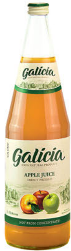
Apple juice 1L