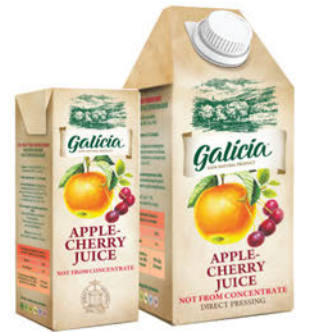
Apple-cherry juice 0,2L, 0,5L