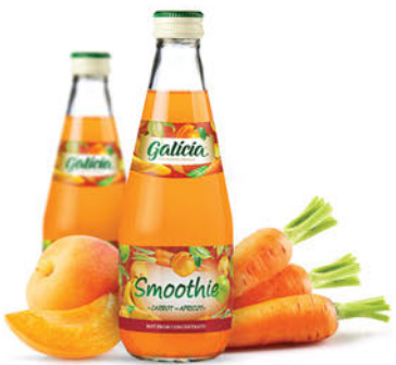
Apple-Carrot-Banana-Apricot Smoothie, 0,3 L

Galicia™ Smoothies are made of high quality NFC juices and purees using only natural ingredients with no sugar, water or preservatives. We use the latest direct pressed technology (which implies a minimal heat treatment) to preserve maximum flavor and beneficial properties of the fruits, vegetables and berries.