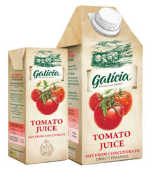
Tomato juice 0,2L, 0,5L