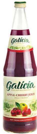
Apple-cherry juice 1L