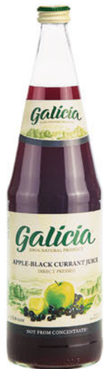
Apple-black currant juice 1L