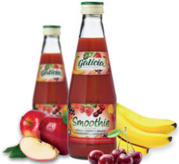
Apple-Cherry-Banana-Strawberry-Chokeberry Smoothie, 0,3 L