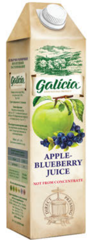
Apple-blueberry juice 1L