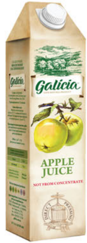
Apple juice 1L