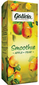
Apple-Pear Smoothie 0,2 L