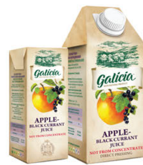
Apple-black currant juice 0,2L, 0,5L