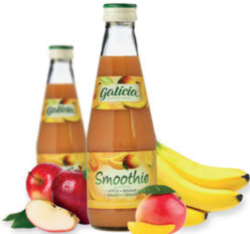
Apple-Banana-Mango-Orange Smoothie, 0,3 L