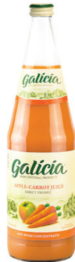
Apple-carrot juice 1L