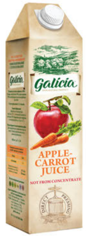
Apple-carrot juice 1L