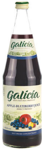
Apple-blueberry juice 1L