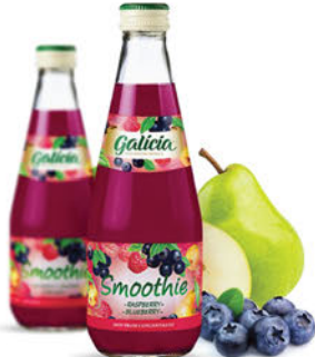
Apple-Pear-Blueberry-Raspberry Smoothie, 0,3 L