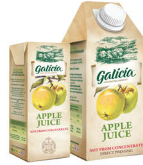
Apple juice 0,2L, 0,5L