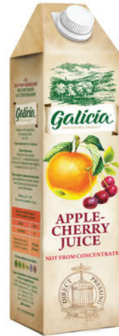
Apple-cherry juice 1L