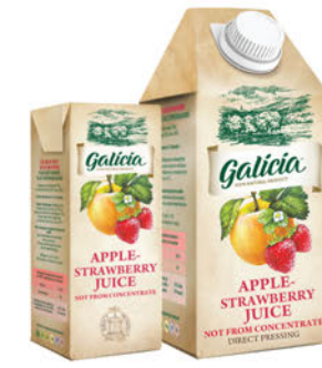
Apple-strawberry juice 0,2L, 0,5L