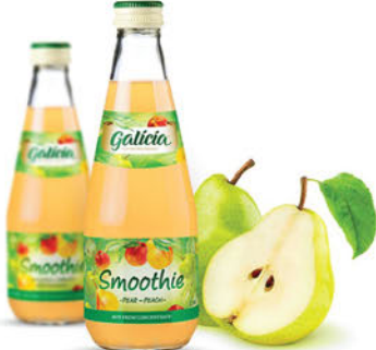
Apple-Pear-Peach Smoothie, 0,3 L