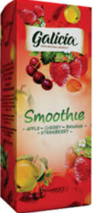
Apple-Cherry-Banana-Strawberry Smoothie 0,2 L