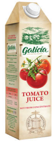
Tomato juice 1L