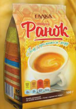
GOLD with HONEY