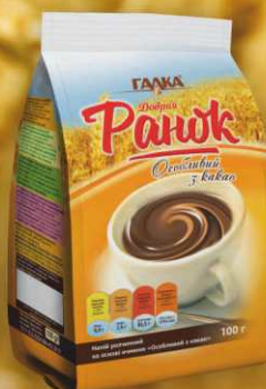
SPECIAL with COCOA