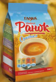
ORIGINAL with SUGAR BEET