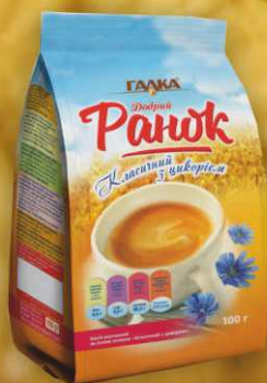
CLASSIC with CHICORY