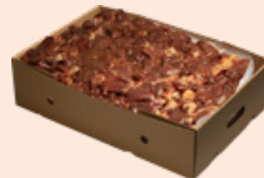
Heart & liver