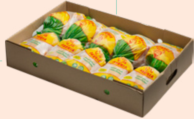
Weight Graduation: 0.9 kg, 1.0 kg, 1.1 kg, 1.2 kg, 1.3kg, 1.4 kg, 1.5 kg