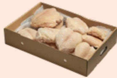
Breast with bone and skin